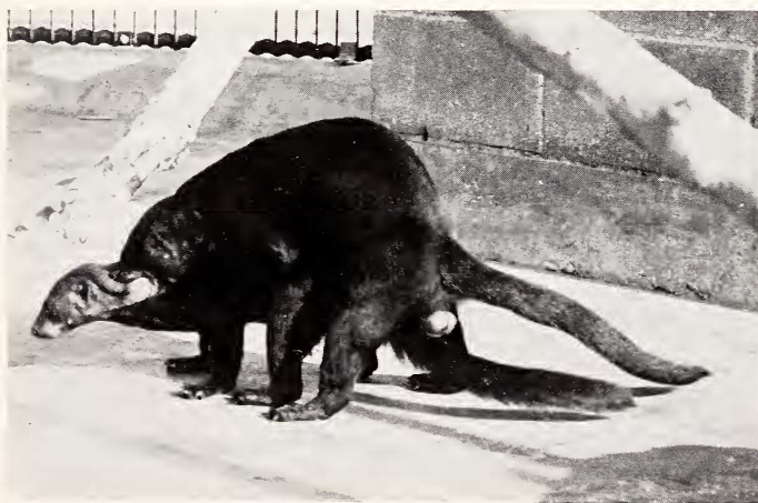
Fig. 2. ♂ mounting ♀; note nape bite and large scrotum

On January 17 both animals were transferred back to their old quarters and in the afternoon the ♂ again mounted the ♀. He held her by the nape for 25 minutes, stimulating her with pushing motions of his wrists at her flanks, but without intromission. The ♀ remained silent, but the ♂ was very vocal, keckering and uttering rasping sounds. On January 18, four copulations, two possibly with intromission, were recorded, which lasted 3 and 8 minutes; the other two were probably disrupted by zoo visitors. The ♀'s vulva was only slightly swollen. January 19: one mounting